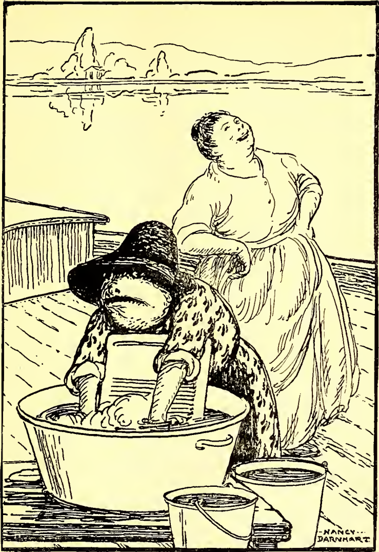
LOST THE SOAP, FOR THE FIFTIETH TIME